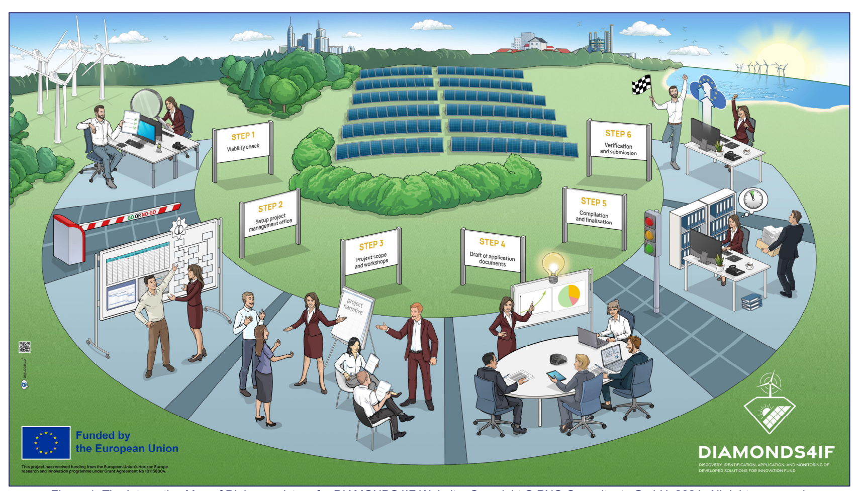
Figure 1: The Interactive Map of Dialogue picture for DIAMONDS4IF Website.