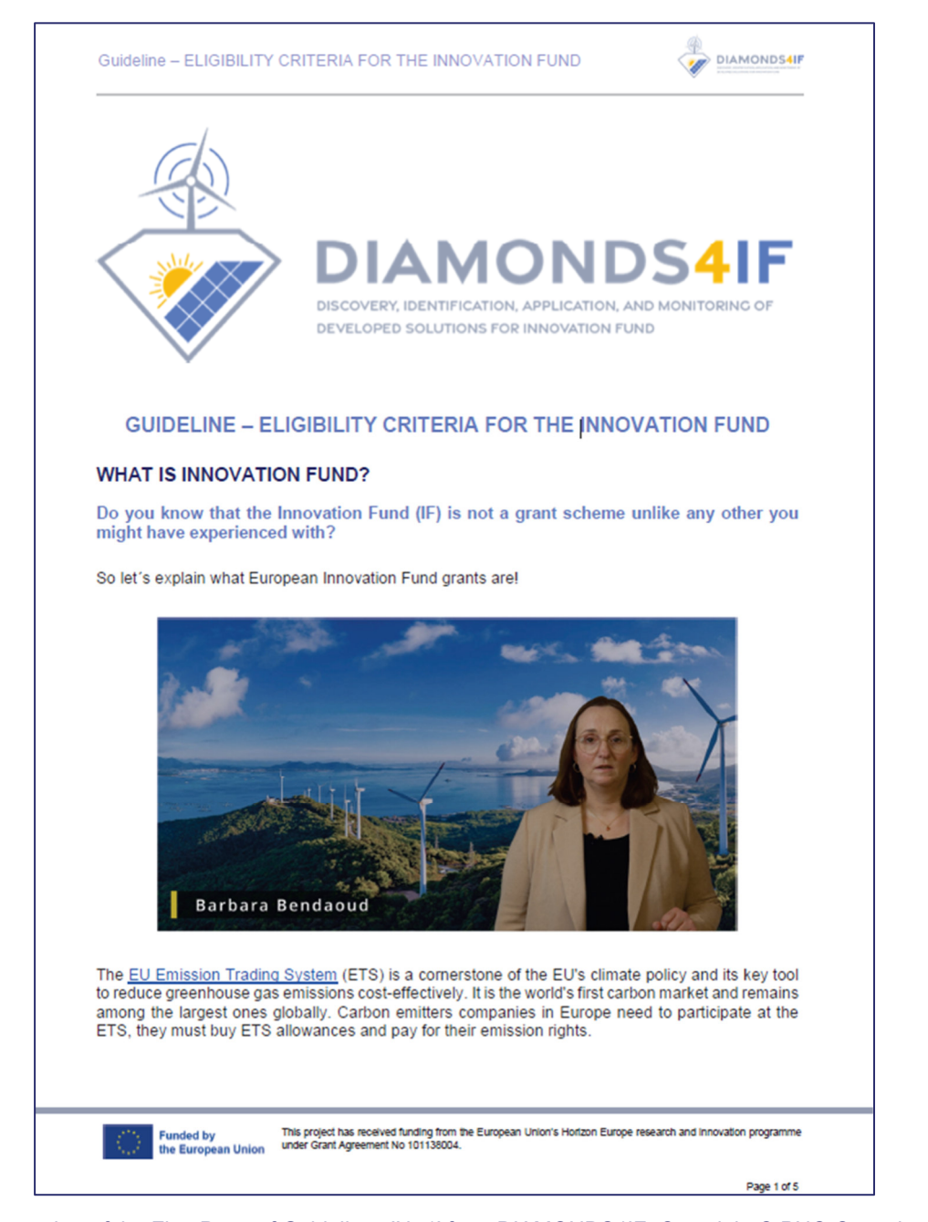
Figure 7: Screenshot of the First Page of Guidelines 'Nr.1' from DIAMONDS4IF.