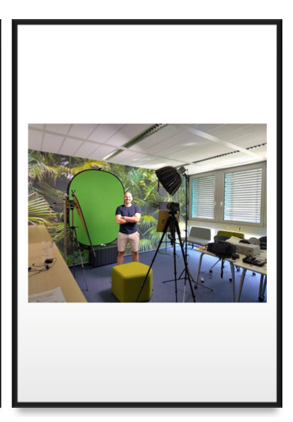
Figure 5: Backstage during the video shooting for DIAMONDS4IF.