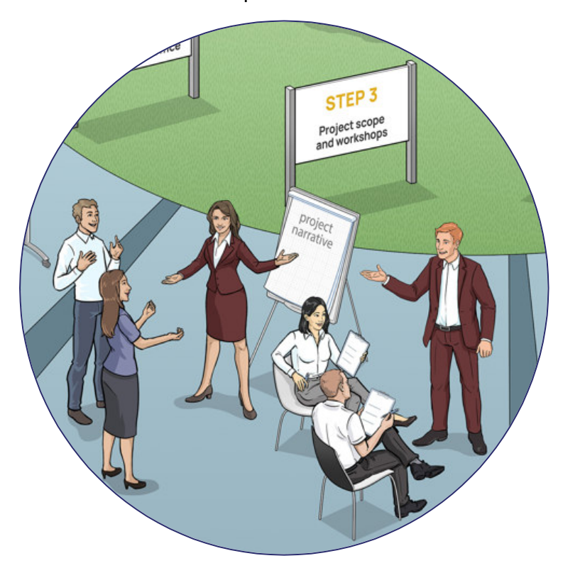
Figure 8: Short visualization of Step 3: Develop the project narrative and conduct dedicated workshops to prepare the supporting documents.

PNO developed such workshop formats for all parts of the Innovation Fund (4<sup>th</sup> call) which will be updated with information of the 5th call when published.