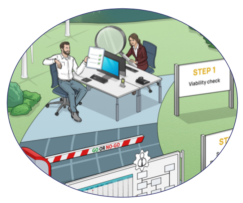
Figure 3: Viability Check - Define the Go or No-Go decision for the next step of the IF Application. Copyright © PNO Consultants GmbH, 2024. All rights reserved.

As displayed in the Dialogue picture, the Viability Check represents the first step of the whole application process.