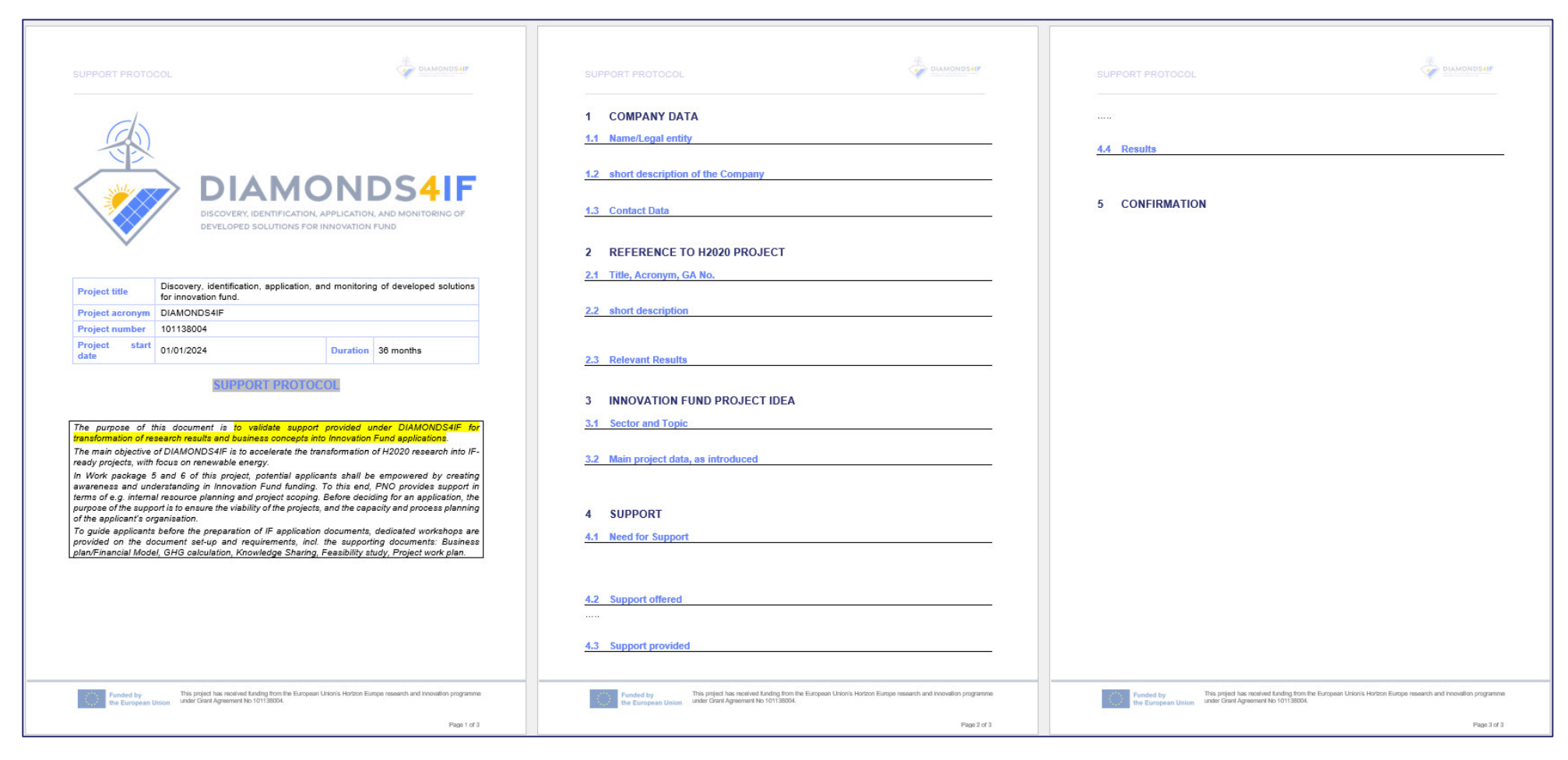
Figure 4: Screenshot of the template of the final protocol after the Viability Check.